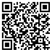
Bible Project Video #1